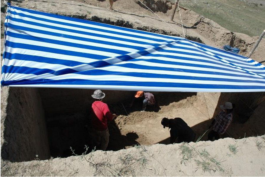
The site of Karama under excavation (1)