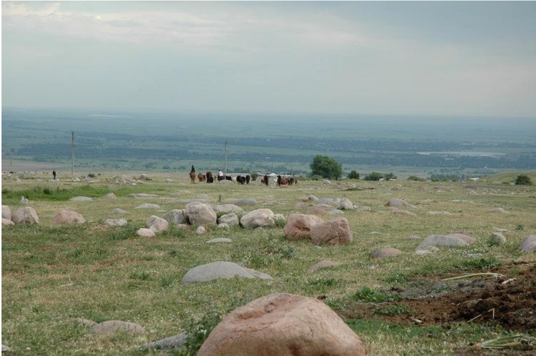
Grazing of cattle (horses, cows and sheep) in the Karama region