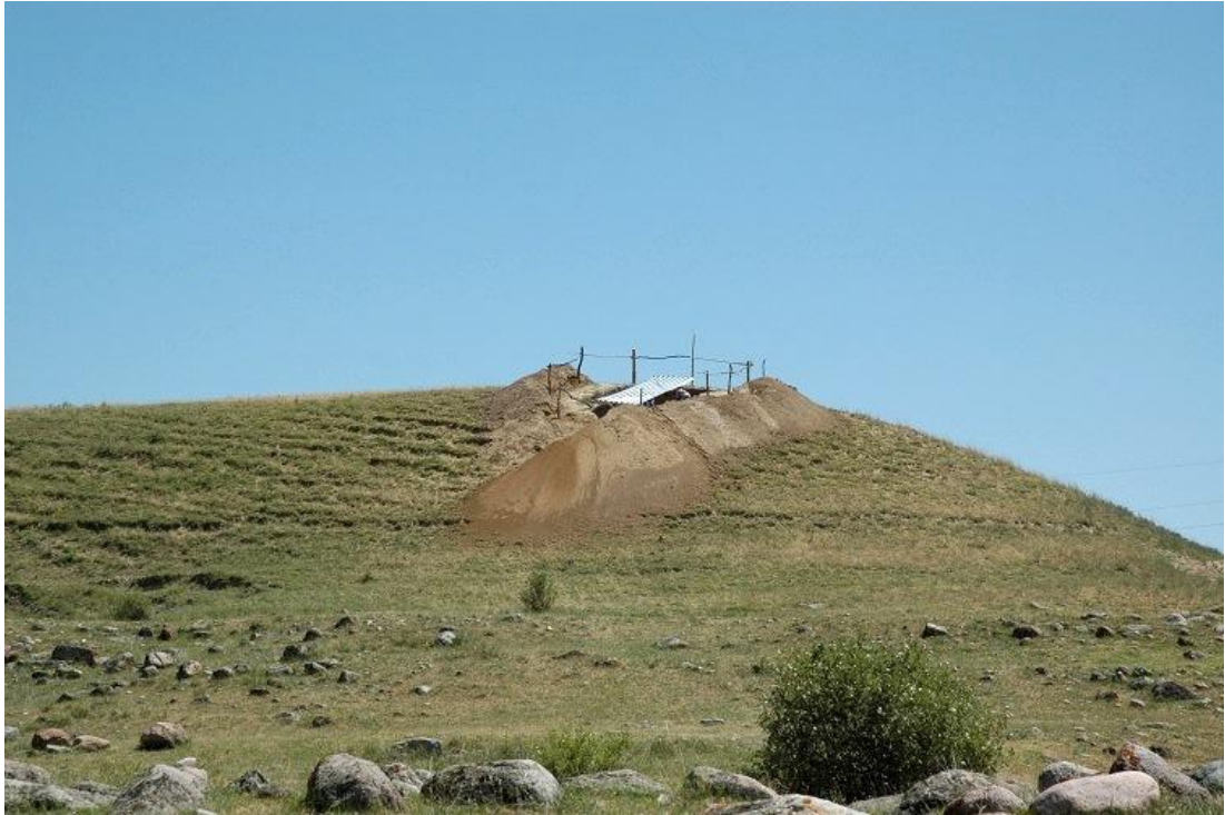
General view of the site of Karama