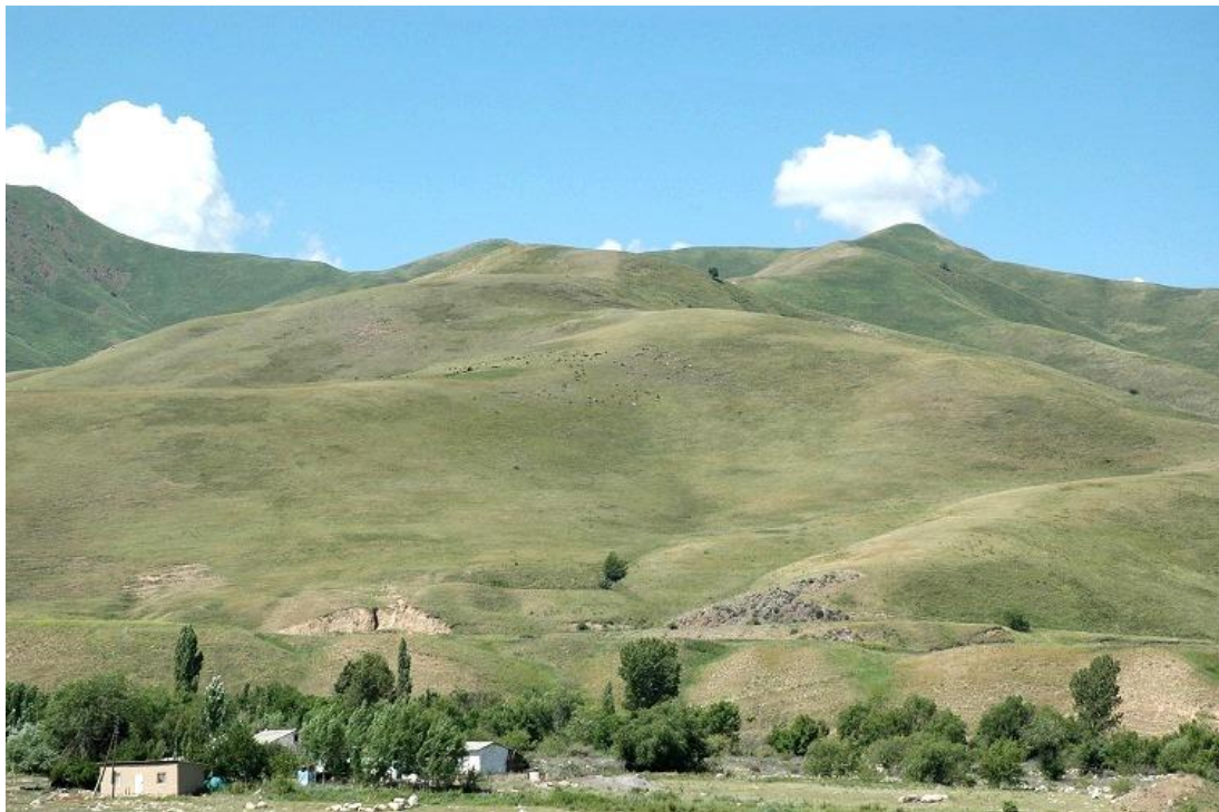
Grazing of cattle on a mountain slope, recognizable at the center of the photo