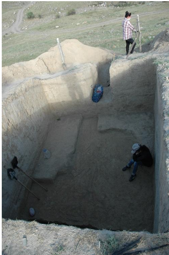
The site of Karama under excavation (2)