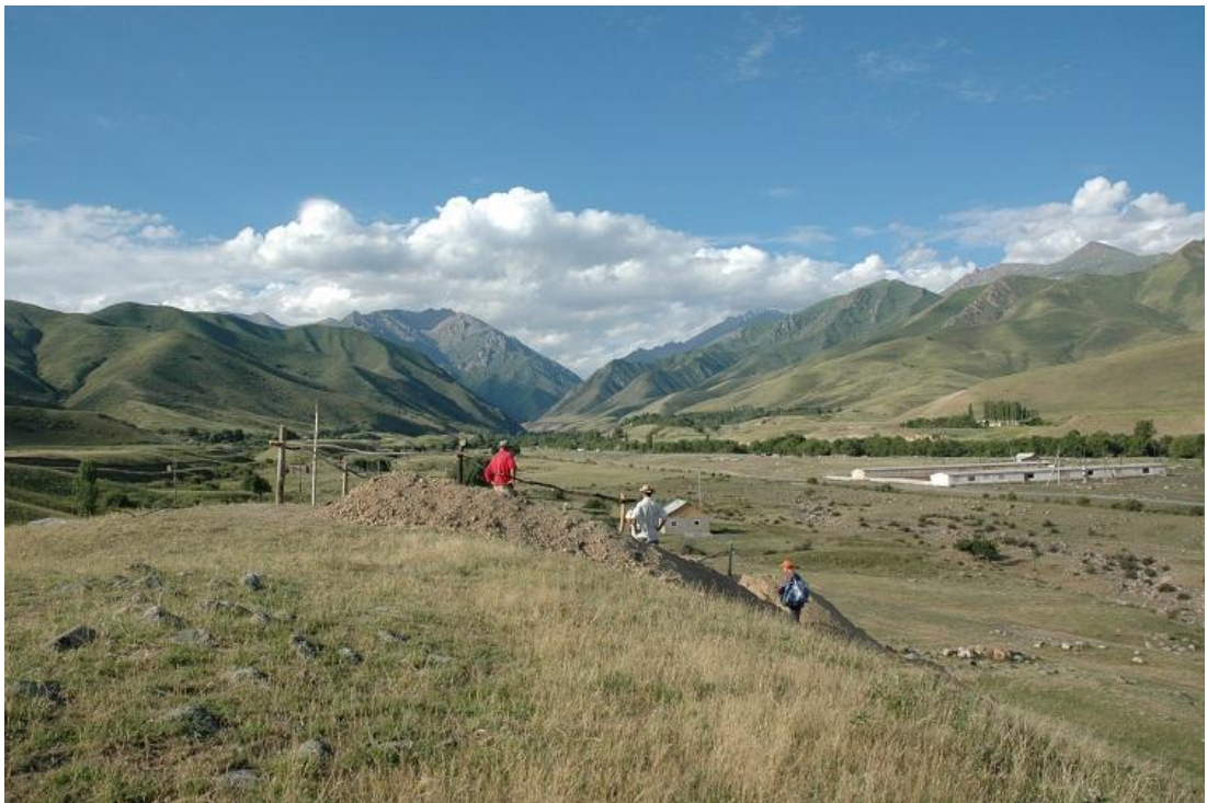
The Tian Shan Mountains seen from the site of Karama