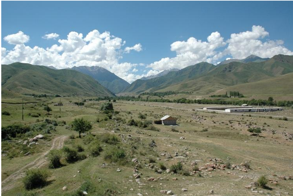
The Tian Shan Mountains and the Karama region